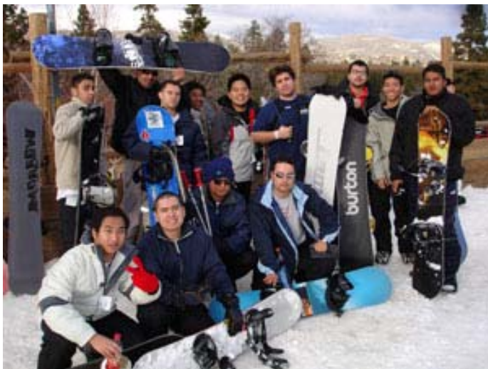
(IEEE members at Big Bear Mountain)

To celebrate the end of Fall Quarter 2005, IEEE and many others had a wonderful time at Big Bear Mountain, where its highest peak is 8,805 feet, and it occupies approximately 748 acres of land. During the day, everyone went snowboarding and had a great time. Just like any other place for recreation, Big Bear Mountain had different courses for all levels of expertise, offering 4 different levels of terrain difficulty. Cabins were rented where people could hang out, eat, or just relax from the busy day at the slopes. This was a fun-filled event, and it's just a taste of what IEEE has to offer.