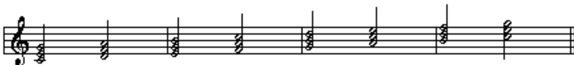
Triads in the key of C